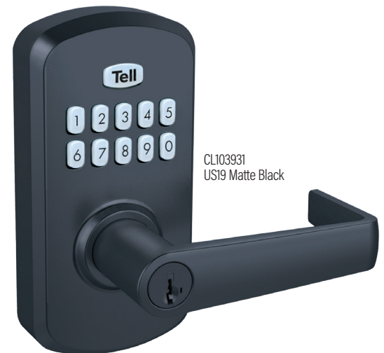
CL103931 US19 Matte Black