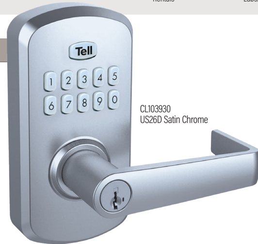
CL103930 US26D Satin Chrome