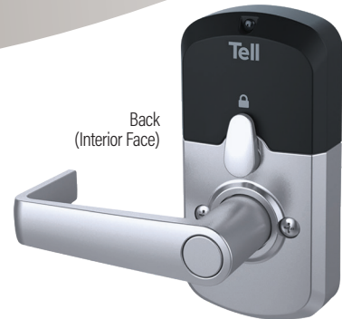
Back (Interior Face)