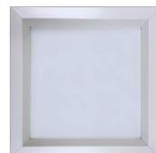
Various Sized Lite Kits Optional